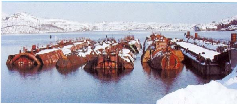
Submarine's nuclear modules SAIDA in one of the docks of Arctic coastline